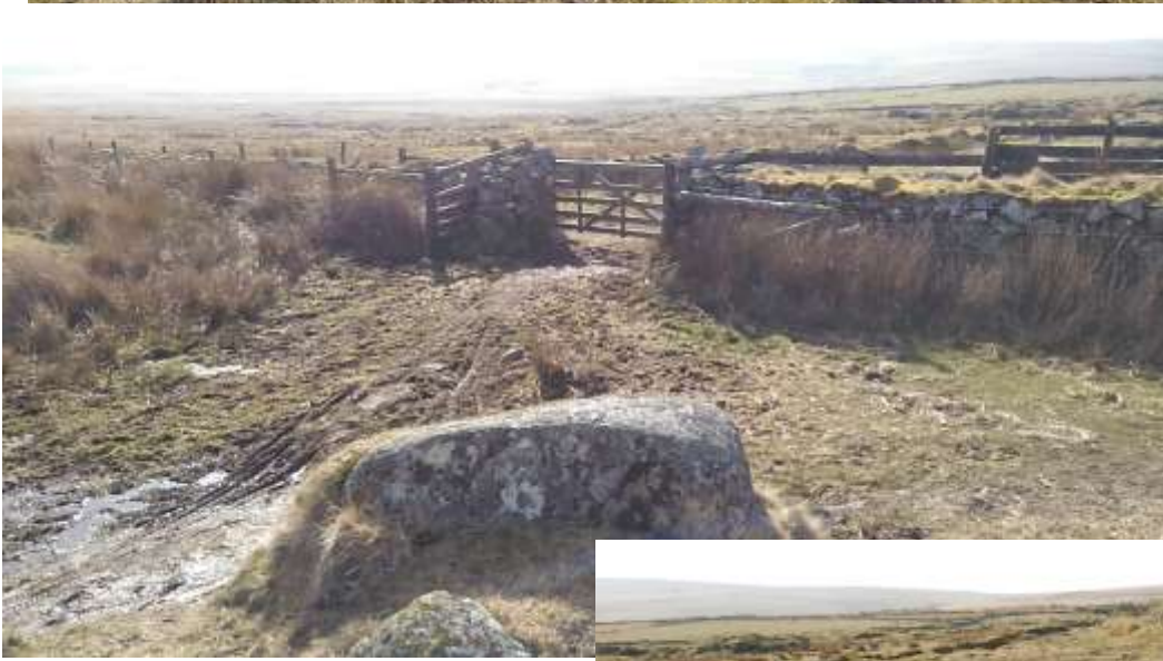
Go through the gate...