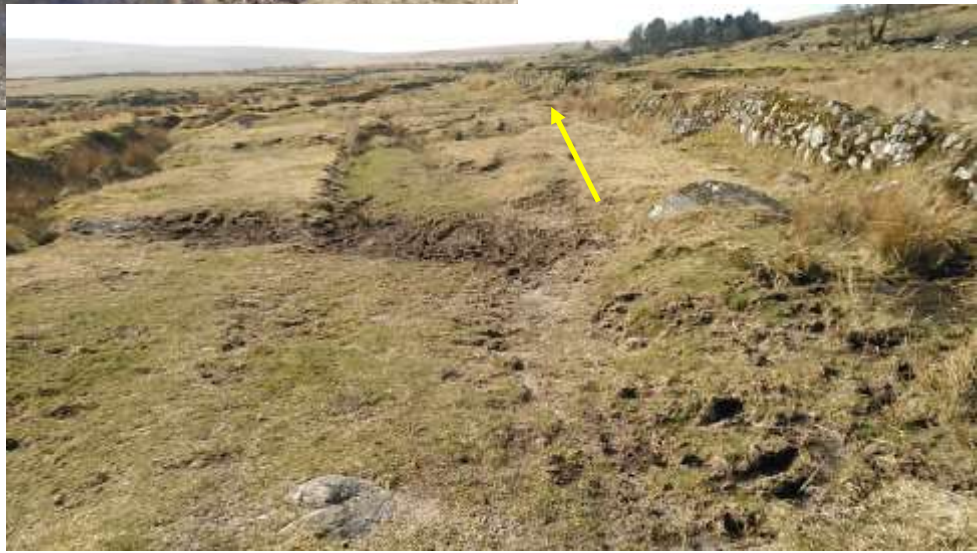
... and follow the track towards the buildings and trees