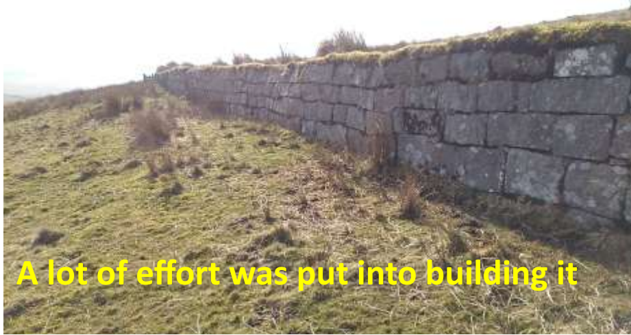
A lot of effort was put into building it