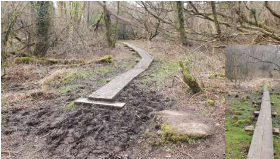
You will walk a very long Board walk