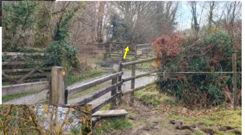
Cross over a driveway