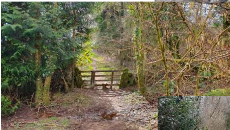
Climb over yet another stile