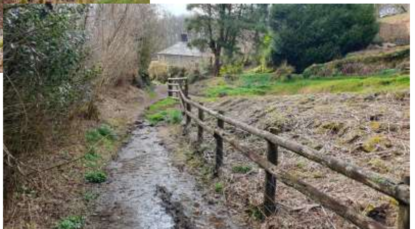
Walk up a stream which is not a bad as it sounds.