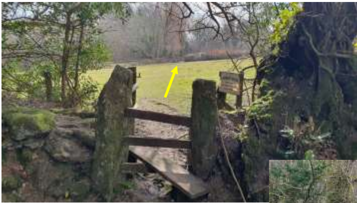
Go over a stile and cross a field