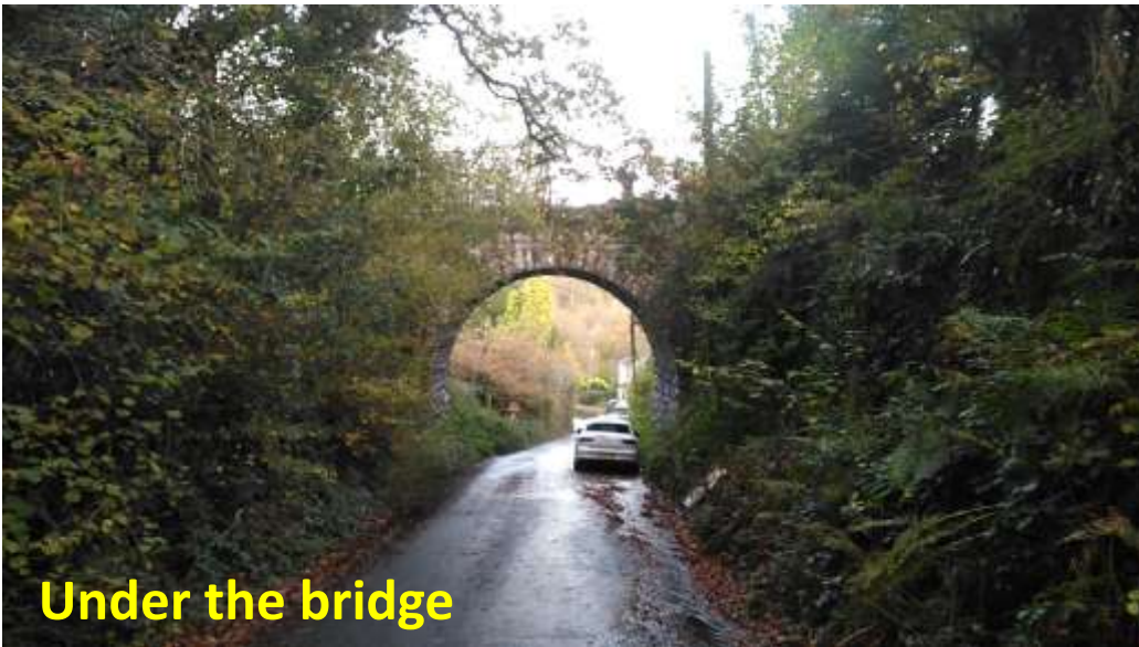
Under the bridge