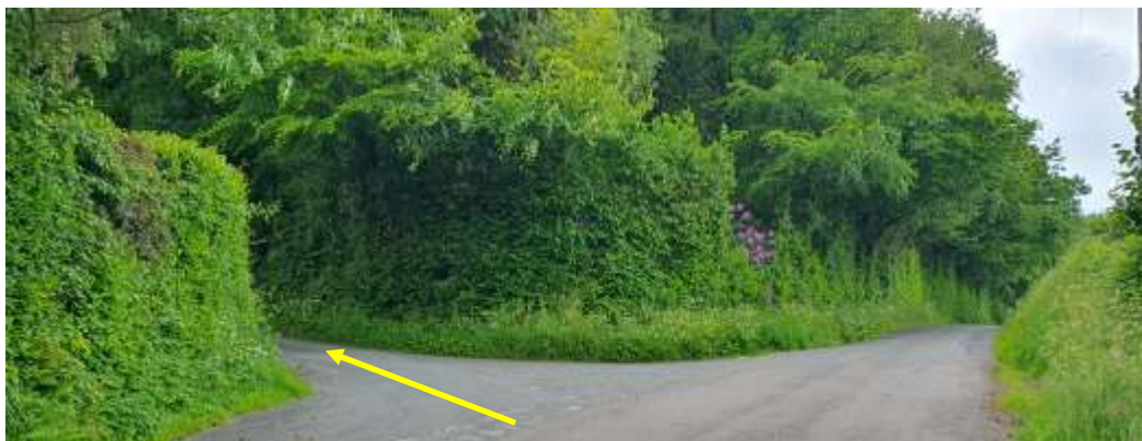
At the next junction just past the houses turn left