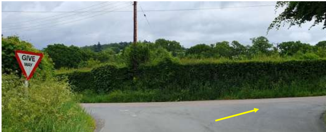
At the T junction turn right