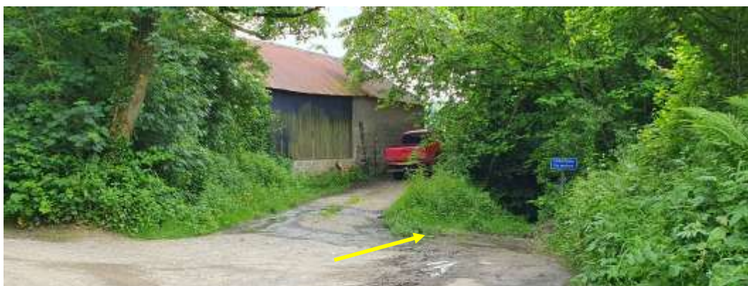
At the top of the hill fork right to go down what once was a road which has been washed away