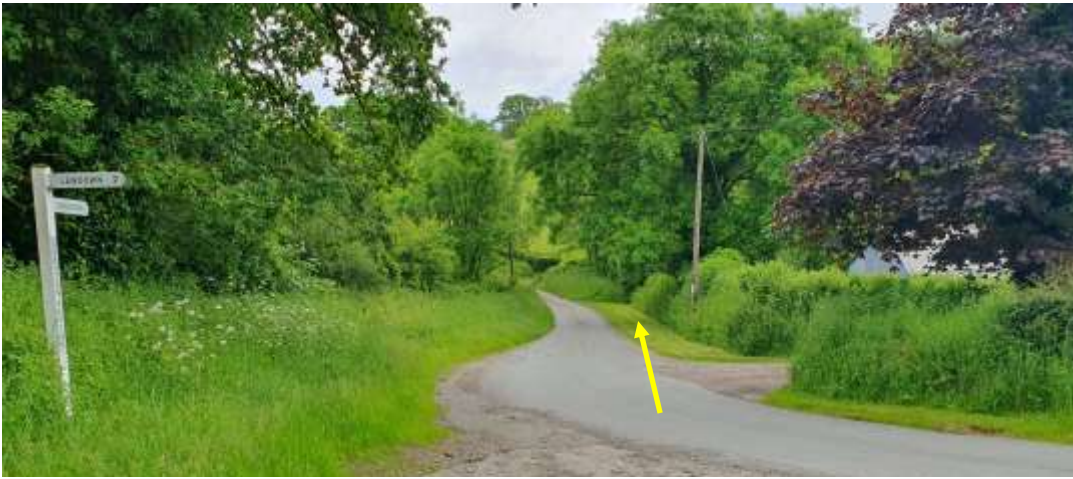
When you reach the road turn left