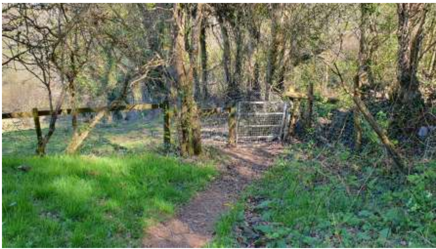
It does get very steep after going through this gate. I found it safer to zig zag down the path/hill