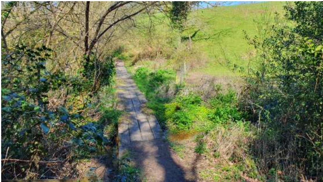
Cross over the board walk