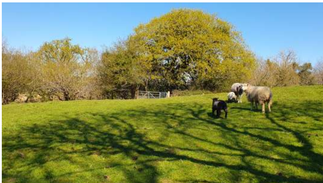
When you reach the field go straight across and through a gate to walk along an ancient sunken path that would surely have been used by the mine workers in medieval times.