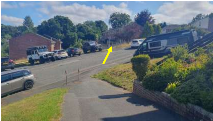
Go diagonally right across the next road to rejoin the path. Then stay on the path until you reach the next road (Barnfield Drive)