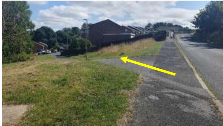
Opposite the railings fork left