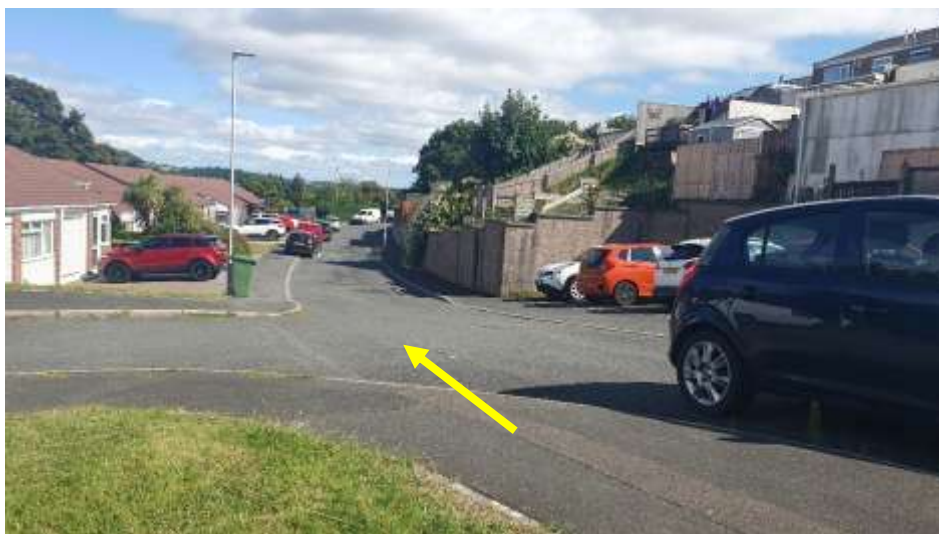
Turn left and staying on the left hand side pavement walk along until you reach a green utilities box on your left.