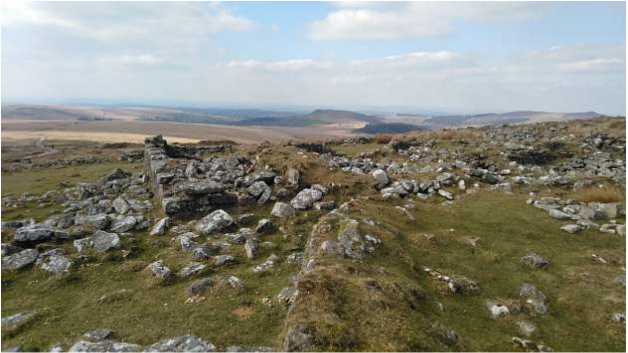
Eylesbarrow tin mine