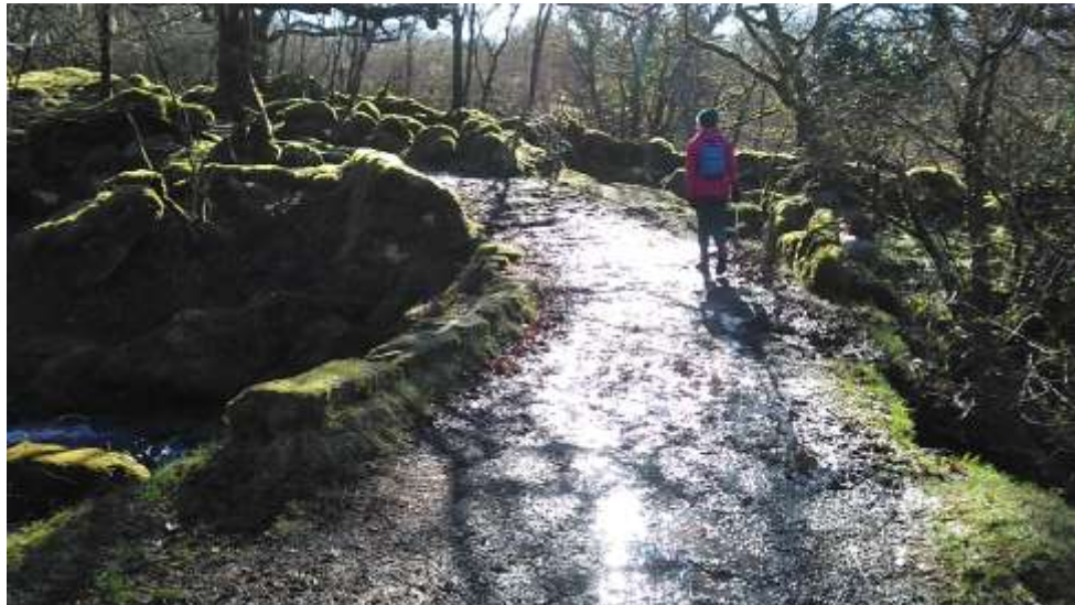
Over a little bridge.....