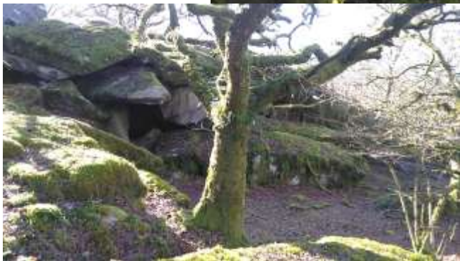
Just before you reach the base of Hucken Tor turn left....