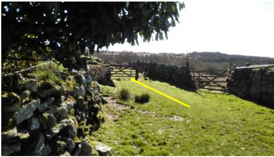
Through another gate.