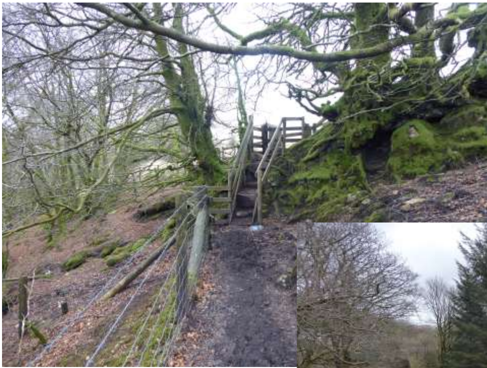
Over a bridge