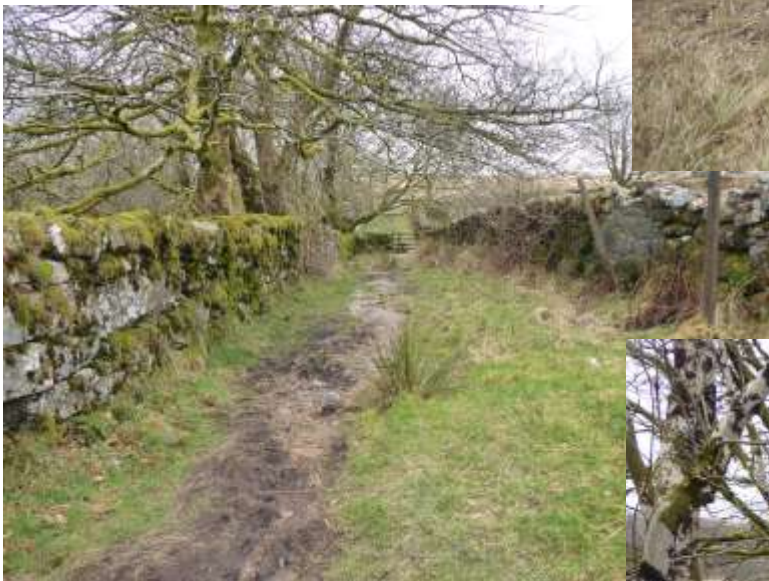
Between two stone walls

And out on to the road where we now turn left and using the wide verge walk back to the car