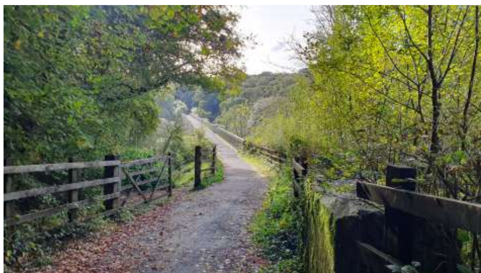
And then over Gem bridge built in 2012