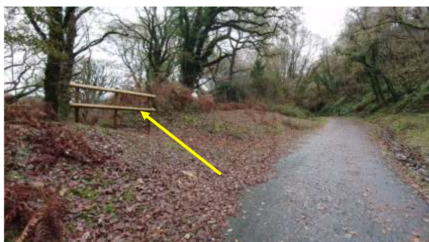
Having gone over Gem bridge and a just past a wall of railway sleepers fork left. Then staying roughly parallel with the cycle track walk up to a bridge by keeping right at various forks in the woodland path.