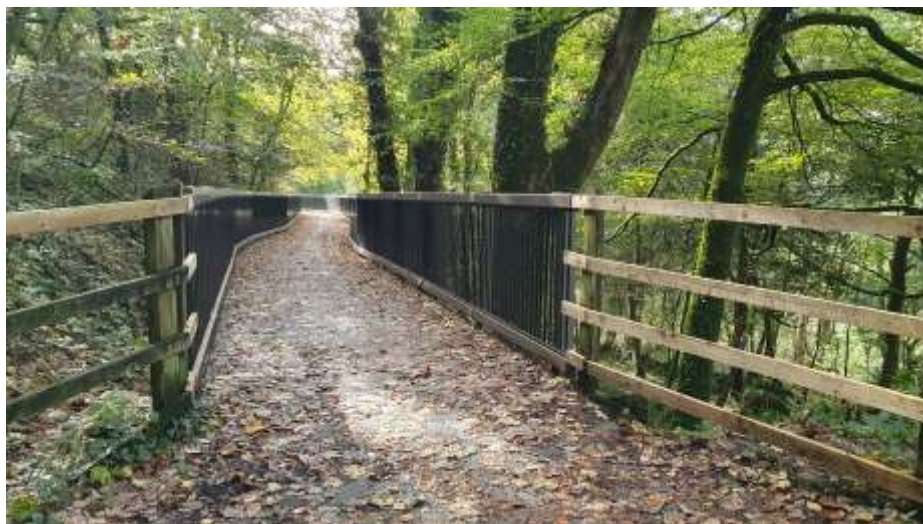
Over a raised board walk that was rebuilt in 2023.