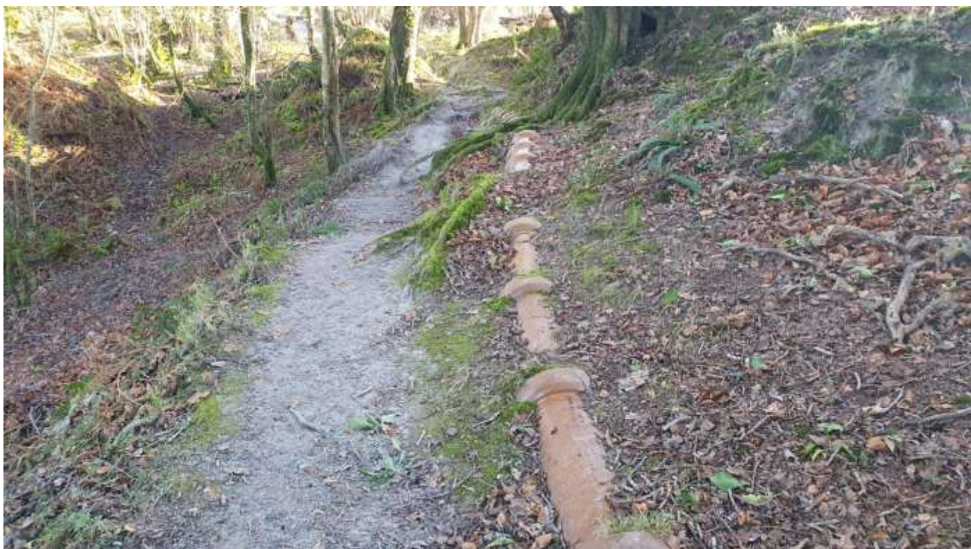
A view of the pipe you will see along the route