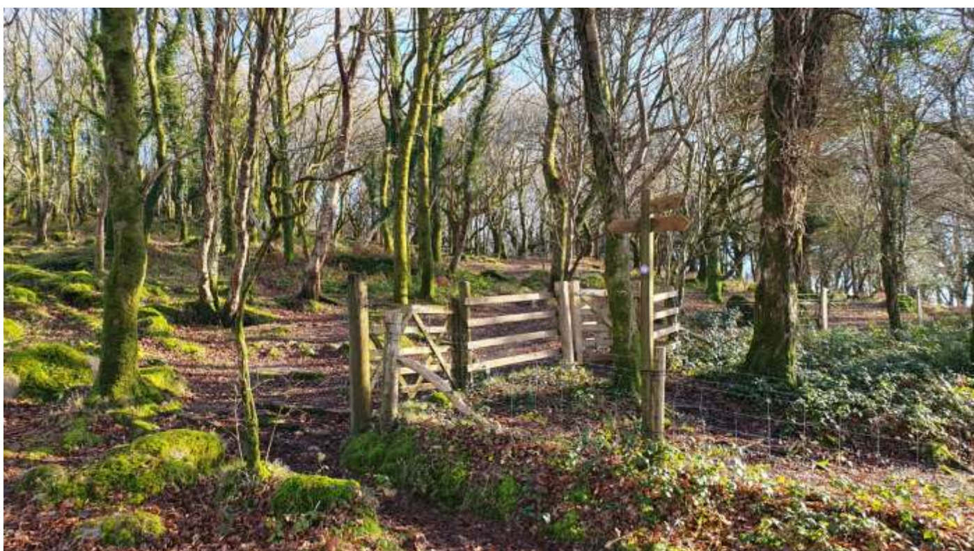
At the next gate keep following the tracks through the woodland by forking either left or right but still going up hill