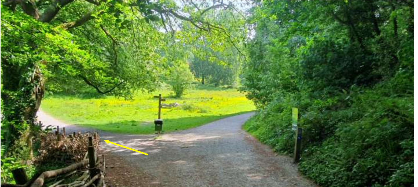
At the Y junction fork left

When you reach the next junction continue straight ahead but first make a short excursion down to another view of the river.