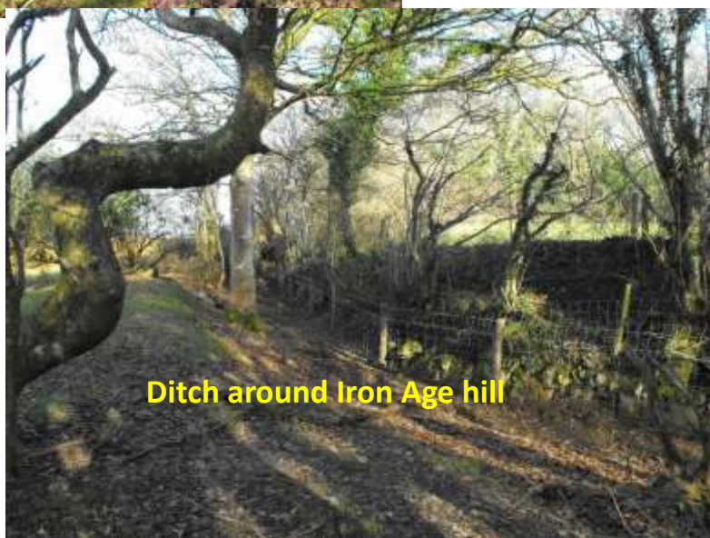
Ditch around Iron Age hill

Go up the slope and keep right to follow the wider track. When you reach a fork you can go either way. You will soon see on your right a ditch and wall which is the boundary of the Iron Age Hill Fort.